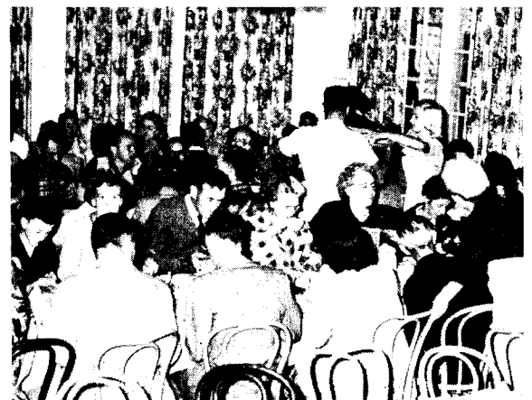
The dining room. Combined with the wonderful spiritual feast was this material feast—one of God's many bounteous blessings for which we were all thankful.