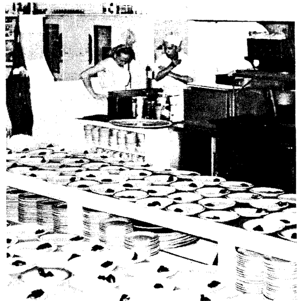
Dozens of plates are being filled with healthful foods. They were then carried on trays by the servers and placed on the dining tables.